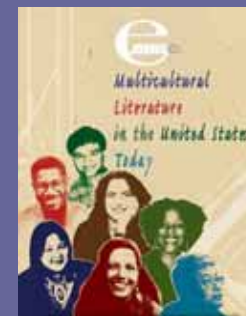
Multicultural Literature in the United States Today

http://www.wilsoncenter.org/topics/pubs/The%20U.S.%20and%20Mexico.%20Towards%20a%20Strategic%20Partnership.pdf