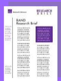
What Are U.S. Policy Options for Dealing with Security in Mexico?

http://www.america.gov/publications/ejournalusa/0509.html