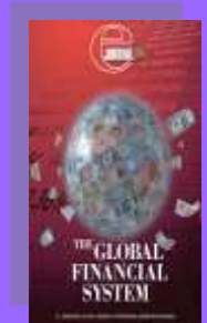
The Global Financial System

http://www.strategicstudiesinstitute.army.mil/pubs/display.cfm?pubID=918