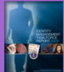
Identity Management Taskforce Report 2008

http://www.eia.doe.gov/oi/aeo/pdf/0383(2009).pdf