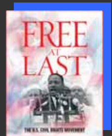
Free At Last - The U.S. Civil Rights Movement

http://www.america.gov/publications/books/poe.html