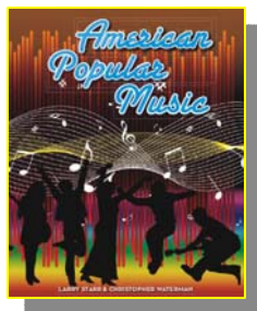
American Popular Music

http://www.america.gov/publications/books/american-popular-music.html