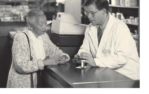
Your pharmacist can help keep track of your medicines.