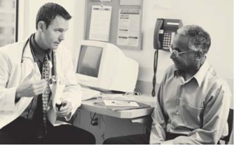
Tell your health professionals about your medical history and about all medicines or supplements you take.