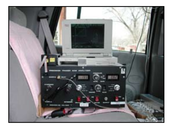
A fast response analyzer that measures tracer concentrations every second. The analyzer is easily carried in the back seat of a vehicle.

The SF_6 analyzers include a computer controlled calibration system and an integrated global positioning system (GPS) that tags each data point with sampling time and location. The systems can be used in cars, boats, aircraft, and buildings. The current configuration easily sits in an automobile or aircraft passenger seat and attaches with standard seat belts.