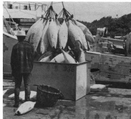
Fisheries of Hawaii and U.S.-associated Pacific Islands