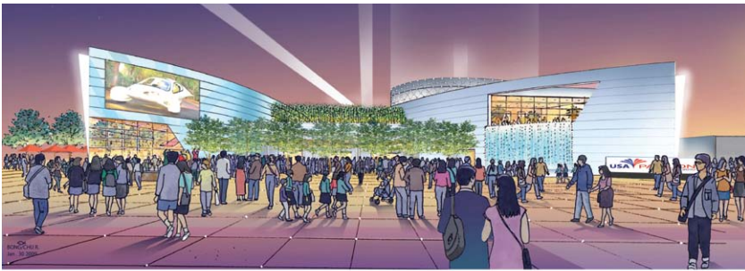
The U.S. pavilion at Shanghai Expo 2010, shown here in an artist's conception, will display four themes: sustainability, teamwork, health, and the Chinese community in the United States.