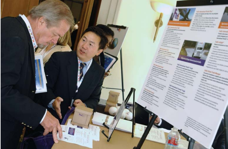
Attendees at The Americas Business Forum were able to view exhibits by sponsors of the event, such as City National Bank, FedEx (shown here), Los Angeles World Airports, Musick Peeler, the Port of Los Angeles, and others.

Events such as the Americas Business Forum help highlight those opportunities and are part of the Department of Commerce’s strategy to lead the way for U.S. firms seeking to do business in those regions. “We are focused,” emphasized Locke, “on creating a broader foundation of prosperity that opens new markets, expands trade, and powers new growth all across the hemisphere.”