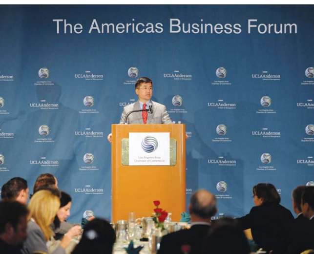
Secretary of Commerce Gary Locke addresses The Americas Business Forum, held in Los Angeles, California, on May 27–28, 2009. The event was an opportunity for representatives of small and medium-sized enterprises to learn about opportunities in the Western Hemisphere.

Canada and countries in the Caribbean and Latin America are some of the best trading partners for the United States. They are very familiar with U.S. brands and highly receptive to U.S. products. On May 27–28, 2009, more than 200 business-