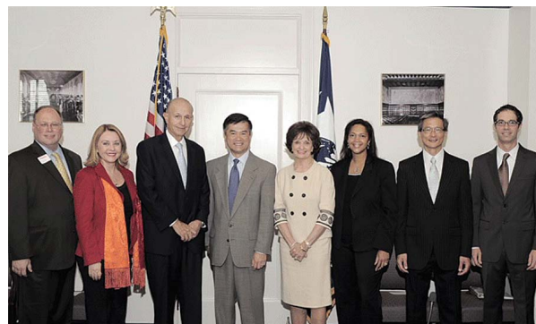
Members of the Travel and Tourism Advisory Board met with Secretary of Commerce Gary Locke (center) in Washington, D.C., on June 9, 2009, to discuss critical issues that the travel and tourism industry faces.