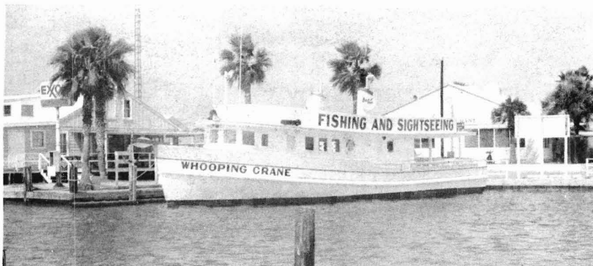
Figure 2.—A typical headboat used on Texas bays.