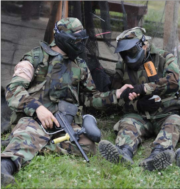
Operation Bushmaster and Operation Kerkesner occurred at Fort Indiantown Gap, Pa., July 2009.