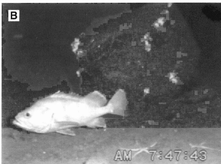
Figure 2.—A shortraker rockfish on silt (A) and on pebble next to a 1 m diameter boulder (B).