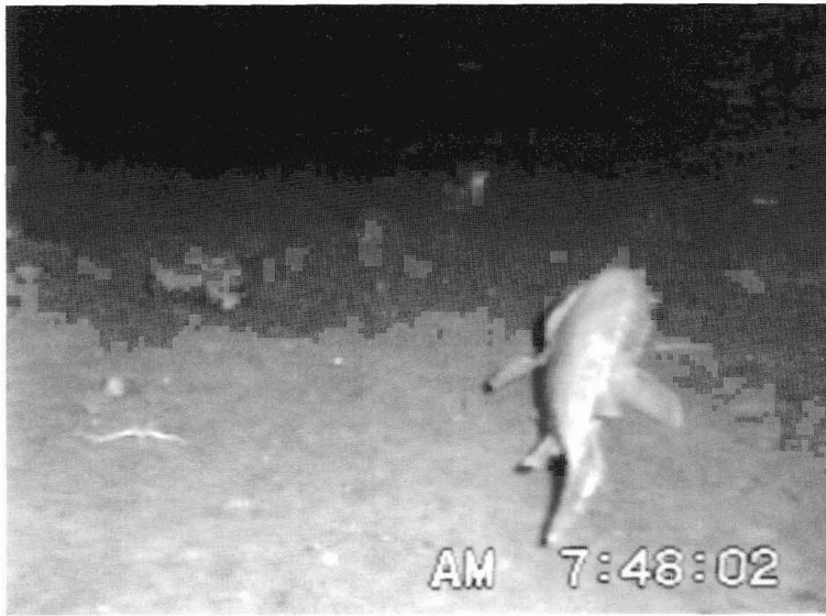
Figure 3.—A shorttraker rockfish tilted with the current.