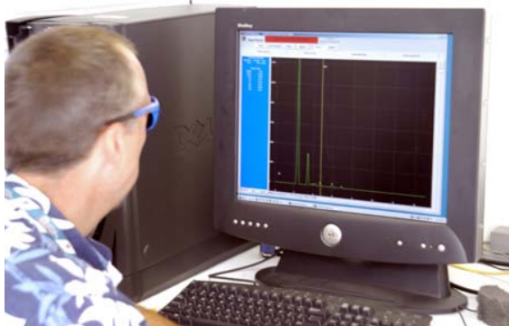
The operator is alerted when explosives are discovered

On the operator's command, a vacuum draws in a large volume of air and collects a sample from the air stream onto a metalized screen. After retrieval of the sample, the preconcentrator desorbs the compounds into a smaller parcel of air that is then delivered to an on-board chemical detector.