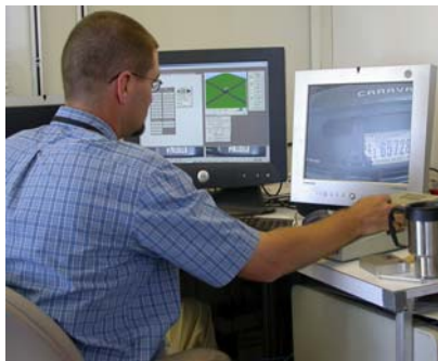
The RoboHound™ operator can view the area to be sampled on the screen on the right; and robotic controls display on the monitor on the left