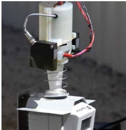
Sample Collector and Preconcentrator