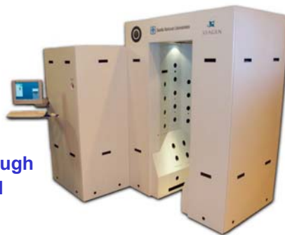
Walk-through Personnel Portal