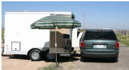
Checking a vehicle for explosives using a prototype vehicle portal