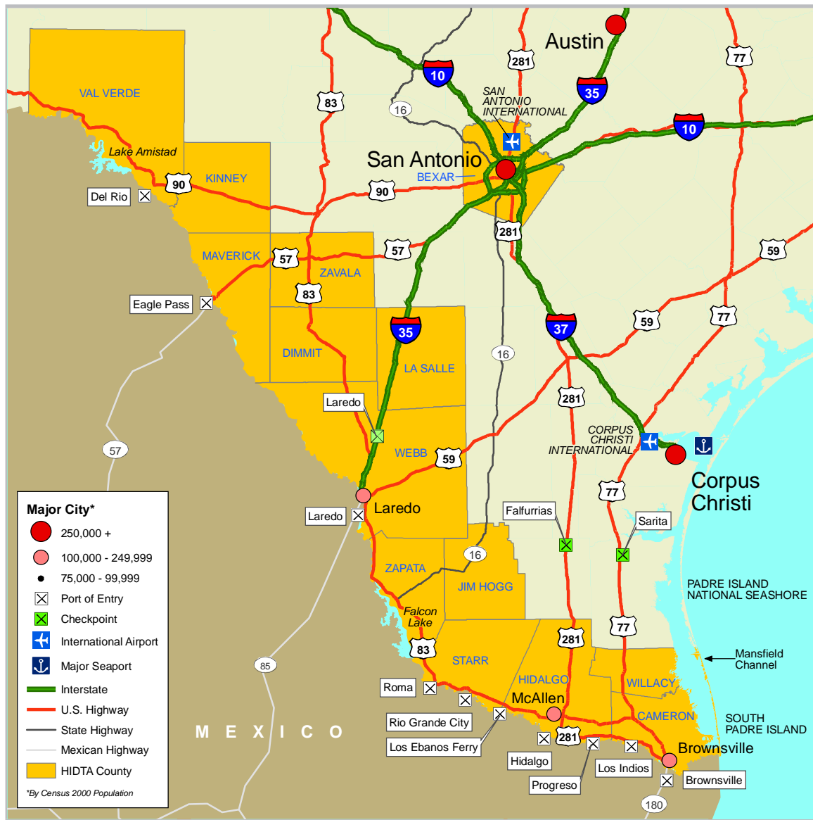
Figure 2. South Texas HIDTA region transportation infrastructure.