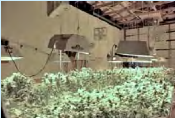
Figure 3. Indoor Grow Operation Powered by a 20,000-Watt Diesel Generator

High-potency marijuana is produced at numerous indoor cannabis grow operations in the region to meet the increasing demand for the drug. Indoor cannabis cultivation operations are generally managed by Asian DTOs and criminal groups. Additionally, some Canada-based Asian DTOs are relocating high-potency, hydroponic indoor grow operations to the region from Canada to avoid law enforcement interdiction