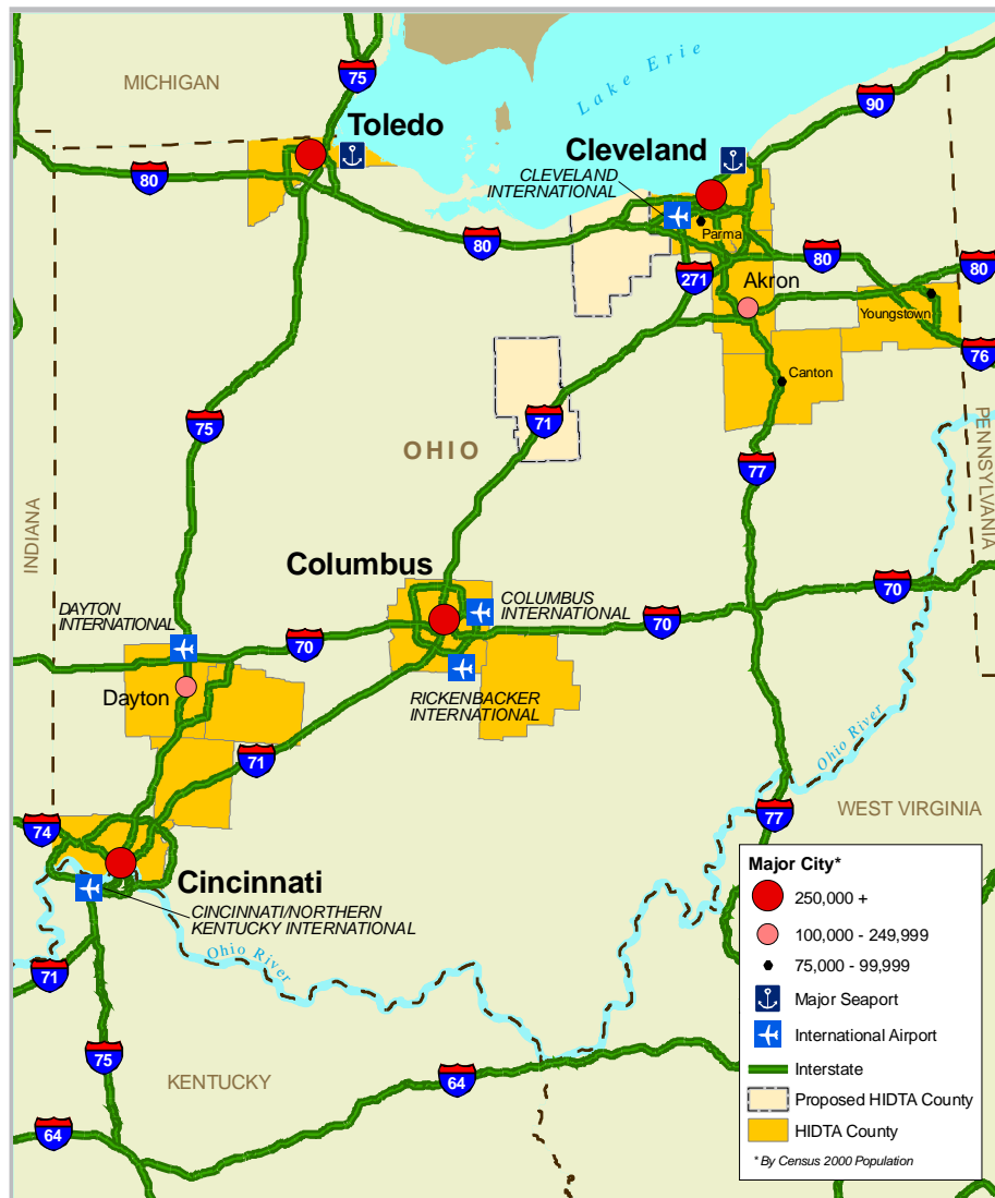
Figure 2. Ohio HIDTA Region Transportation Infrastructure

primarily use north-south highways such as Interstates 71, 75, and 77 and east-west highways such as Interstates 70 and 80/90 to transport illicit drugs from distribution centers along the Southwest Border. (See Figure 2.) Additionally, traffickers often conceal drug shipments in hidden compartments in private and commercial vehicles in an attempt to avoid detection by law enforcement officials. For example, in September 2008 the Greene County Agencies for Combined Enforcement discovered a hidden compartment in a vehicle after two small magnets were discovered on one of the suspects; the magnets were