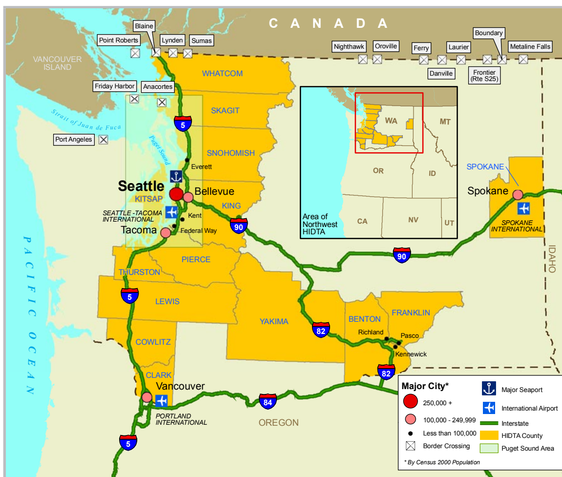
Figure 1. Northwest High Intensity Drug Trafficking Area transportation infrastructure.

This assessment provides a strategic overview of the illicit drug situation in the Northwest High Intensity Drug Trafficking Area (HIDTA), highlighting significant trends and law enforcement concerns related to the trafficking and abuse of illicit drugs. The report was prepared through detailed analysis of recent law enforcement reporting, information obtained through interviews with law enforcement and public health officials, and available statistical data. The report is designed to provide policymakers, resource planners, and law enforcement officials with a focused discussion of key drug issues and developments facing the Northwest HIDTA.