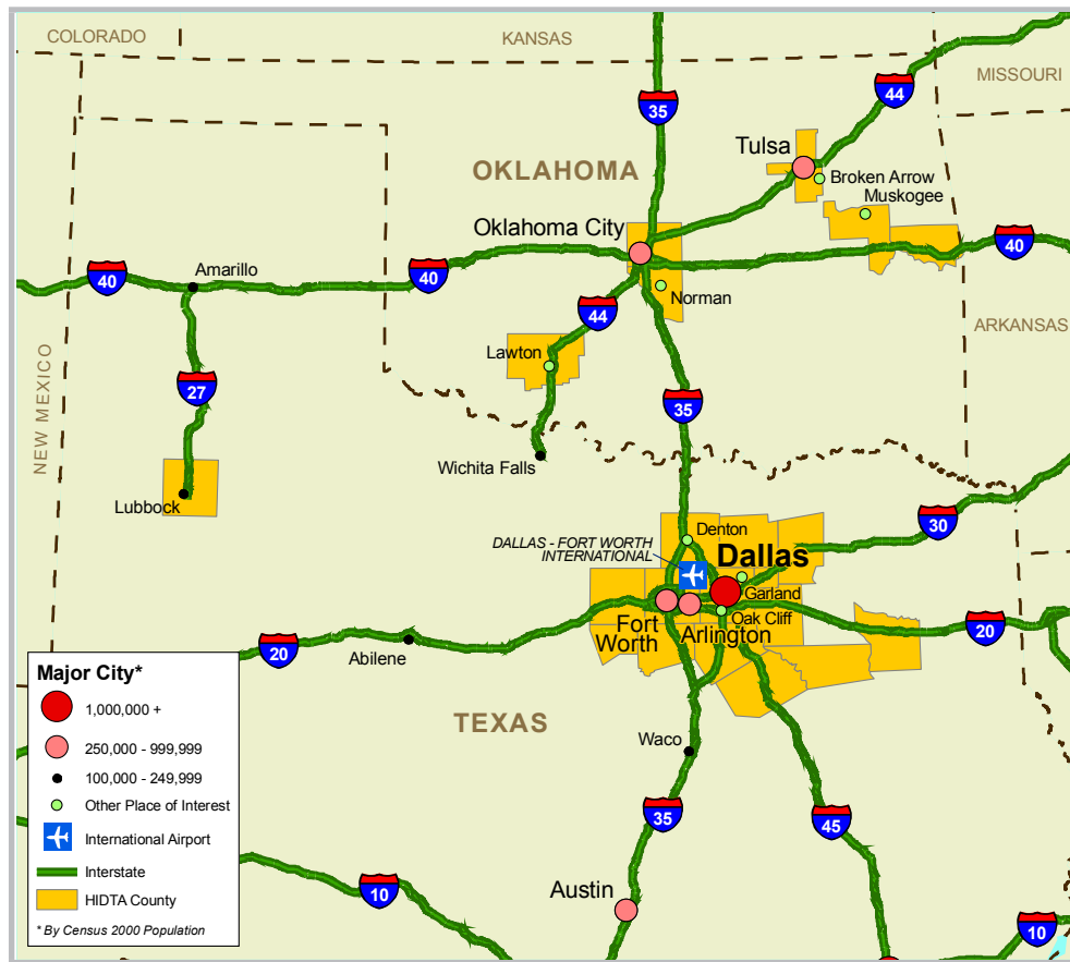
Figure 2. North Texas HIDTA Region Transportation Infrastructure

Interstate 35 is the primary north-south transportation corridor leading directly from the Southwest Border at Laredo—one of the busiest ports of entry (POEs) in the United States—to Dallas/Fort Worth and Oklahoma City. Interstates 40 and 44 pass through Oklahoma City, and Interstates 20, 30, and 45 transit the Dallas/Fort Worth metropolitan area. Interstate 27 extends north from Lubbock and connects with I-40 at Amarillo, Texas. (See Figure 2.) Although I-10 does not traverse any North Texas HIDTA counties, drug traffickers use that route to access I-20, which passes through Dallas/Fort Worth, extends east into South Carolina, and connects with the I-95 corridor, a major north-south route. While a significant portion of the illicit drugs smuggled into the area from Mexico is destined for distribution in the North Texas HIDTA region, the region also