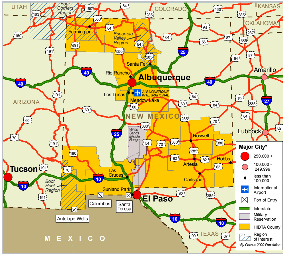
Figure 2. New Mexico HIDTA Region Transportation Infrastructure

Mexico-based DTOs’ rerouting some of their drug shipments through Arizona and, to a lesser extent, California for further transport to Albuquerque and Las Cruces as well as to the Four Corners, Espanola Valley, and southeastern regions of the HIDTA region. (See Figure 2.) For example, U. S. Customs and Border Protection (CBP) officers seized significantly more heroin at the Nogales port of entry (POE) in 2008 than they had in previous years, a development they attribute to a shift in heroin smuggling routes away from Juárez in favor of the Sonora corridor, where levels of violence and law enforcement presence are comparatively minimal. 2 Once the drugs reach New Mexico areas,