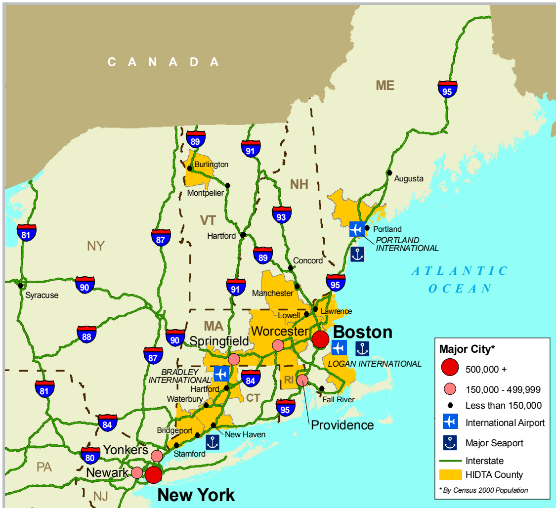
Figure 2. New England HIDTA Region Transportation Infrastructure

region; Dominican DTOs also distribute wholesale quantities of marijuana. They supply the drugs to Dominican DTOs and criminal groups that distribute midlevel and retail-level quantities of the drugs from the Lowell/Lawrence and Hartford/Springfield distribution hubs to various other local criminal groups and street gangs that serve as retail-level distributors in communities throughout the region. However, some local Dominican DTOs and African American, Caucasian, and Mexican criminal groups prefer to travel to the New York City metropolitan area to purchase lower-priced heroin and cocaine directly from Colombian and Dominican wholesale suppliers