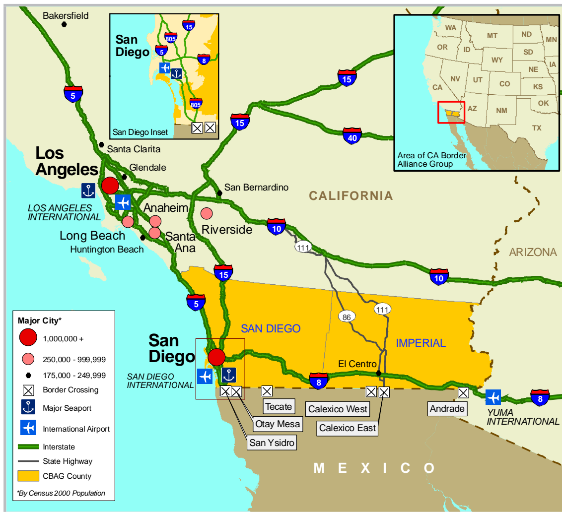
Figure 1. California Border Alliance Group Region

This assessment provides a strategic overview of the illicit drug situation in the California Border Alliance Group (CBAG) region of responsibility, highlighting significant trends and law enforcement concerns related to the trafficking and abuse of illicit drugs. The report was prepared through detailed analysis of recent law enforcement reporting, information obtained through interviews with law enforcement and public health officials, and available statistical data. The report is designed to provide policymakers, resource planners, and law enforcement officials with a focused discussion of key drug issues and developments facing the CBAG region.