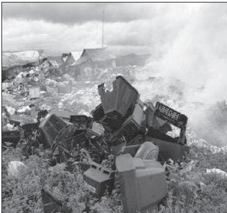
Figure 2: Open Dump Site for Electronic Waste in Cambodia