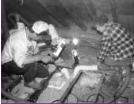
Weatherization crew installs insulation in the attic of a New Jersey home.