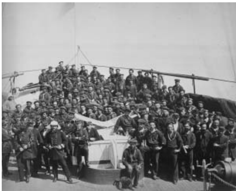
Officers and crew of the USS Monocacy, during the 1871 expedition to Korea. (200-KWG-42)

class. Consulting the dictionary is important for several reasons. It is important to verify that the ship was in fact a U.S. Navy vessel and to verify dates of service. Before conducting a search in ship-related records make sure you have information on the correct vessel. Several ships served at different times under the same name, so first consult the Dictionary of American Naval Fighting Ships to find the dates of service of the vessel you are researching.