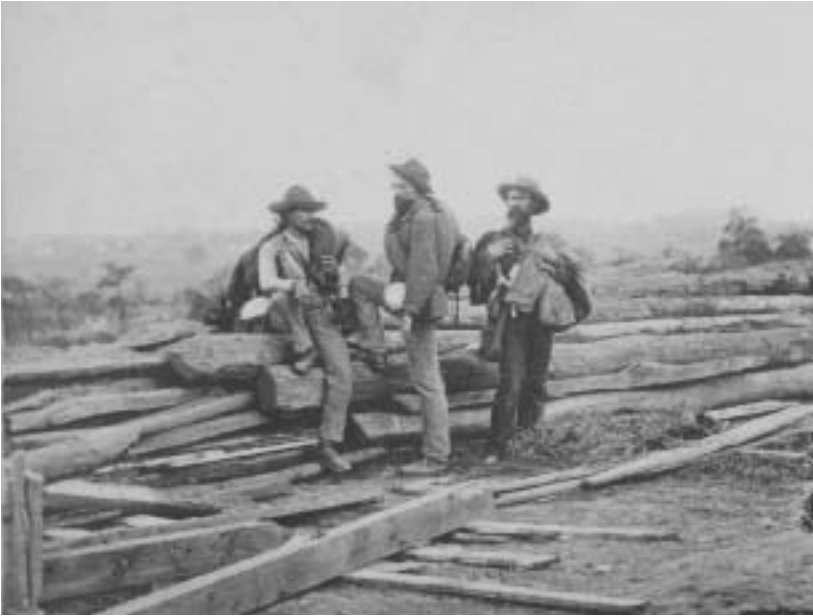
Confederate prisoners standing along a fence in Gettysburg, Pennsylvania. (200-CC-2288)

If you are researching a Confederate soldier, sailor, or marine who was captured during the war consult prisoner-of-war records found on M598, Selected Records of the War Department Relating to Confederate Prisoners of War, 1861–1865 . This microfilm publication contains lists and registers of prisoners of war and records related to individual prisons or stations. Records related to all prisoners include: register of prisoners; register of deaths of prisoners (compiled by the Office of the Commissary General of Prisoners); registers of prisoners' applications for release and decisions; registers related to release of prisoners; registers relating to prisoners' possessions; and registers of deaths of prisoners (compiled by the Surgeon General's Office). These records are followed by the records of individual prisons or stations including Alton, Illinois; Bowling Green, Virginia; Camp Butler, Illinois; Camp Chase, Ohio; Cincinnati, Ohio; Fort Columbus, New York; Department of the Cumberland; Fort Delaware, Delaware; Camp Douglas, Illinois; Elmira, New York; Gratiot and Myrtle Streets Prisons, St. Louis, Missouri; Department of the Gulf; Hart Island, New York; Hilton Head, South