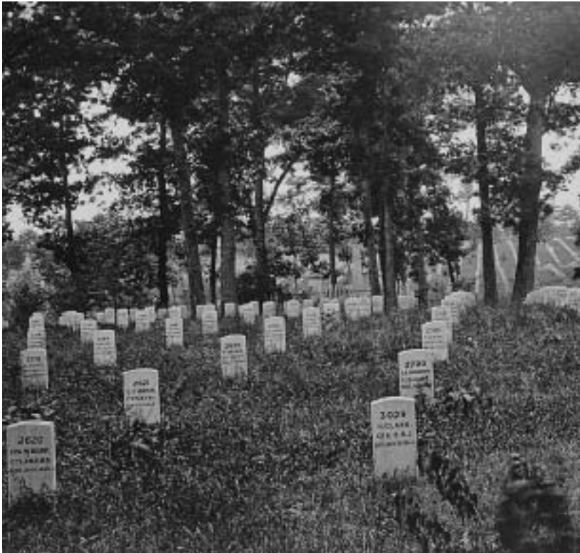
Civil War view of Arlington National Cemetery. (111-B-5304)

More than 40 years after the end of the Civil War, permanent, uniform markers were authorized for the graves of Confederate soldiers buried in national cemeteries. In accordance with an act of March 9, 1906, Congress adopted the same size and material for Confederate headstones as for Union deceased but altered the design to omit the shield and give the stones a pointed rather than rounded top. In 1929 the authorization was extended