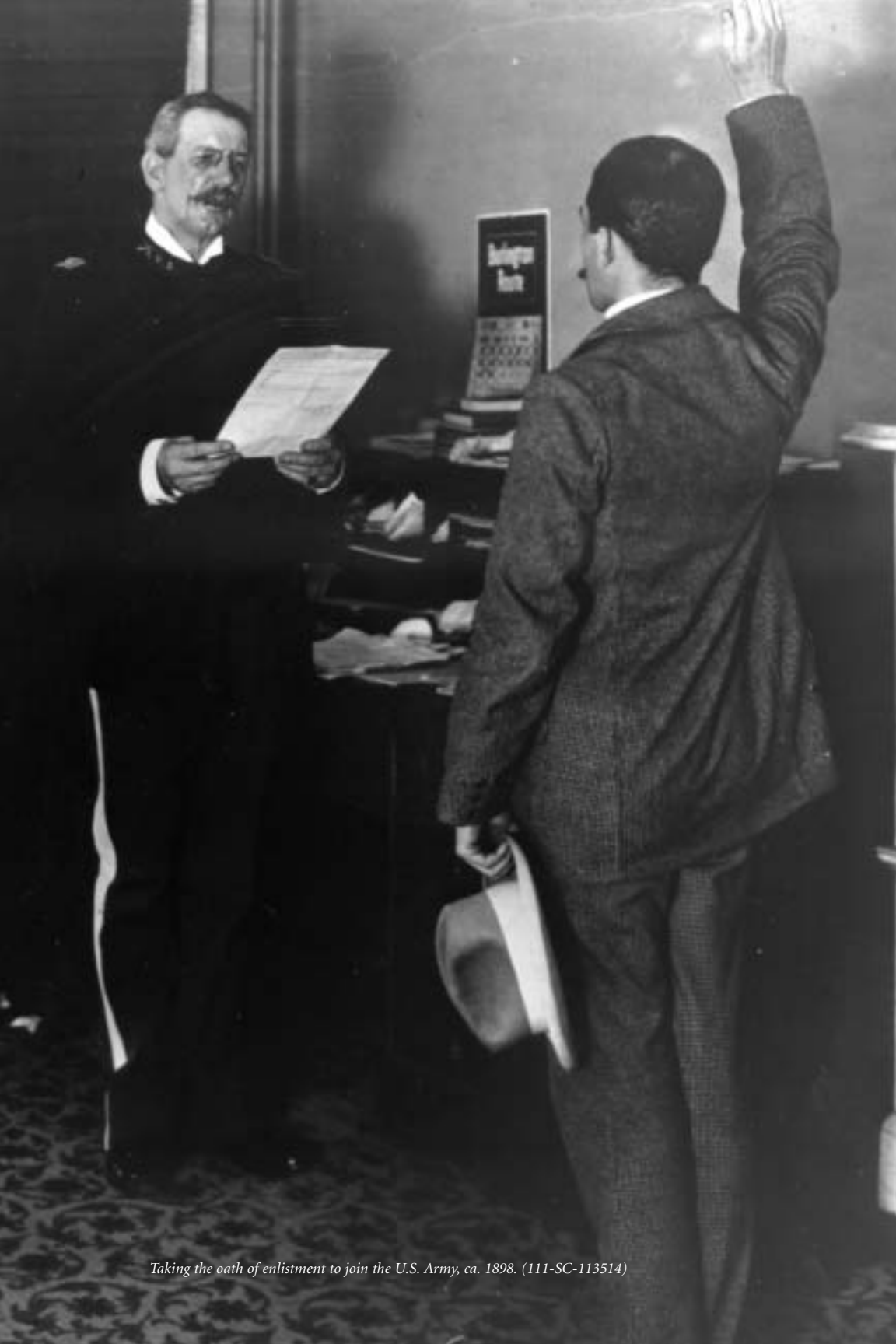
Taking the oath of enlistment to join the U.S. Army, ca. 1898. (111-SC-113514)