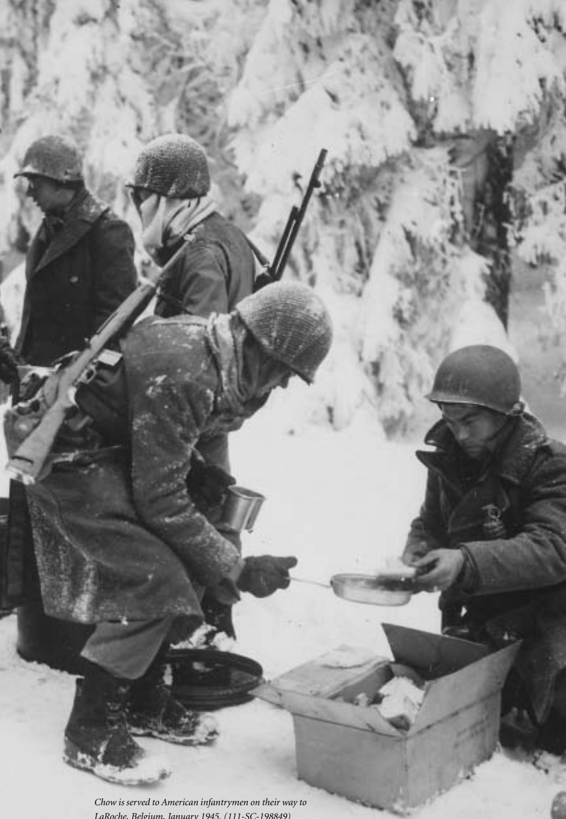
Chow is served to American infantrymen on their way to LaRoche, Belgium, January 1945. (111-SC-198849)