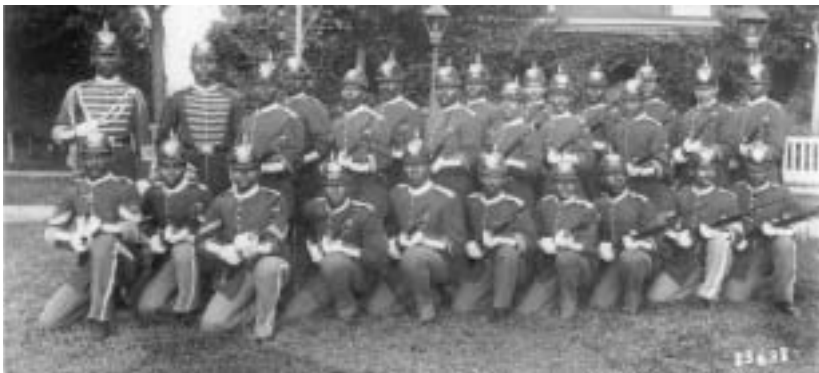
Soldiers of Company I, 25th U.S. Infantry, at Fort Snelling, Minnesota, taken in the 1880s. (111-SC-83638)

The place to start researching black regulars is Regular Army Enlistment Papers, 1798-1912, RG 94, entry 91. This series is arranged alphabetically by name of soldier and generally shows the soldier's name, place of enlistment, date of enlistment, by whom enlisted, age, place of