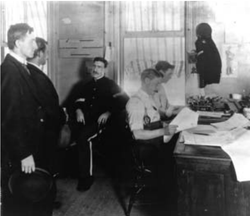
Recruits wait while clerks fill out Army enlistment papers, ca. 1898. These papers are found in entry 91, Enlistment Papers, Record Group 94, Records of the Adjutant General's Office. (111-SC-113512)

For medical information, consult carded medical records found in RG 94, entries 529 and 530 covering the years 1821–85 and 1894–1912 respectively. These cards relate to Regular Army personnel admitted to hospitals for treatment and may include information such as name, rank, organization, age, race, birthplace, date entered service, cause of