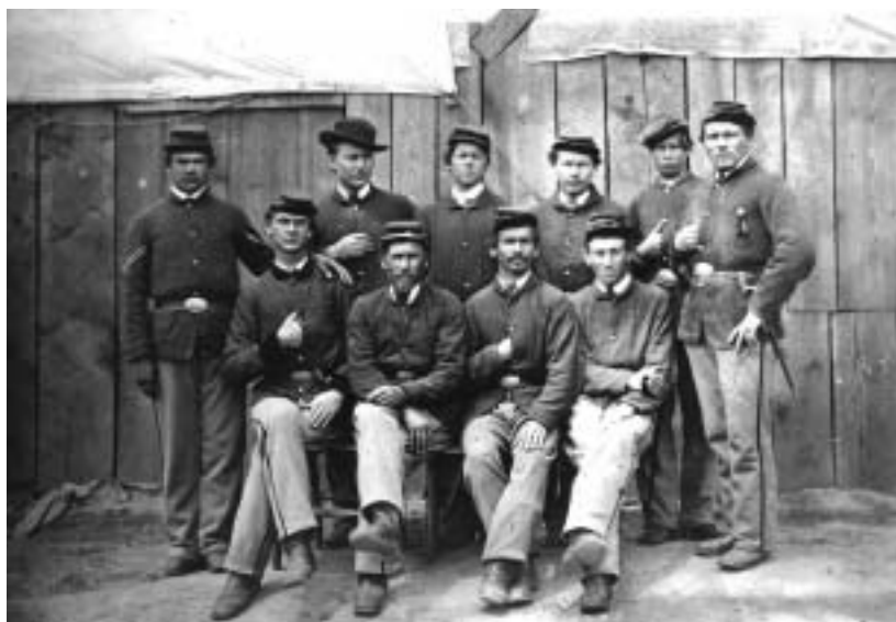
Union soldiers from the Army of the Cumberland awaiting court-martial. (111-B-2738)

Plante, Trevor K. "The Shady Side of the Family Tree: Civil War Union Court-Martial Case Files," Prologue , Winter 1998, Vol. 30, No. 4.