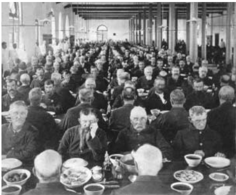
Veterans in the dining hall of the National Home for Disabled Volunteer Soldiers in Marion, Indiana, in the late 1890s.

The home registers have been reproduced as M1749, Historical Registers of National Homes for Disabled Volunteer Soldiers, 1866–1938 . This microfilm publication is available at the National Archives Building in Washington, DC, and many of the National Archives regional facilities. Some of the regional sites have all of the microfilm rolls covered under