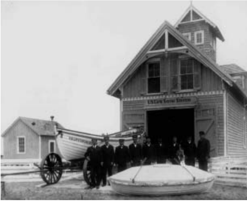
Surfmen with their lifeboat equipment in front of a U.S. Life Saving Station in North Carolina in the late 1800s. Records of the U.S. Coast Guard (Record Group 26) include records of processor agencies such as the U.S. Life-Saving Service. (26-CGS-66-02-01)

The records relating to enlisted crew members of the Revenue Cutter Service include muster rolls, payrolls, and shipping articles. In one series of muster rolls are unbound monthly reports, 1848–1910, arranged by name of vessel and thereunder chronologically. They are not indexed, so they can be searched only by name of vessel and the individual's approximate date of service. Muster rolls and payrolls show the name, and, when appropriate, signature or mark of each crew member. The muster rolls for the Revenue Cutter Service/Coast Guard, 1833–1932, provide name, rating, date and place of enlistment, place of birth, age, occupation, personal description, and number of days served during the reported month for each crew member, along with notes if the crewman was detached, transferred, discharged, deserted, or died during the report period. The records are arranged alphabetically by name of vessel.