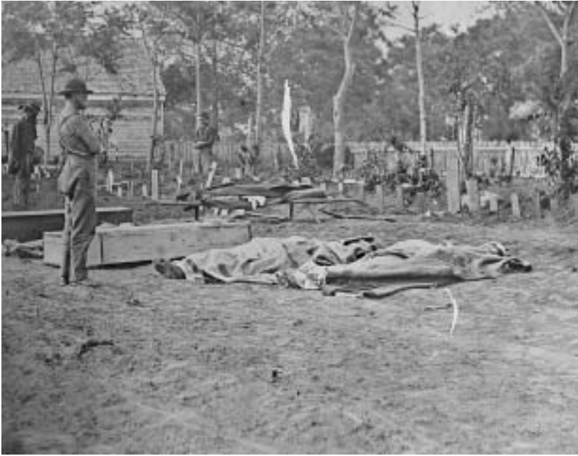
Burying the dead at Fredericksburg, Virginia. (111-B-71)

Another good series to consult is the Applications of Headstones in Private Cemeteries, 1909–1924, found in RG 92, entry 592. The headstone applications were often completed by superintendents of cemeteries and therefore do not contain next-of-kin information. Although the starting date of the series is 1909, many applications were submitted for veterans already buried in cemeteries prior to 1909. Like the card records of headstones, applications can also be found for veterans of earlier conflicts.