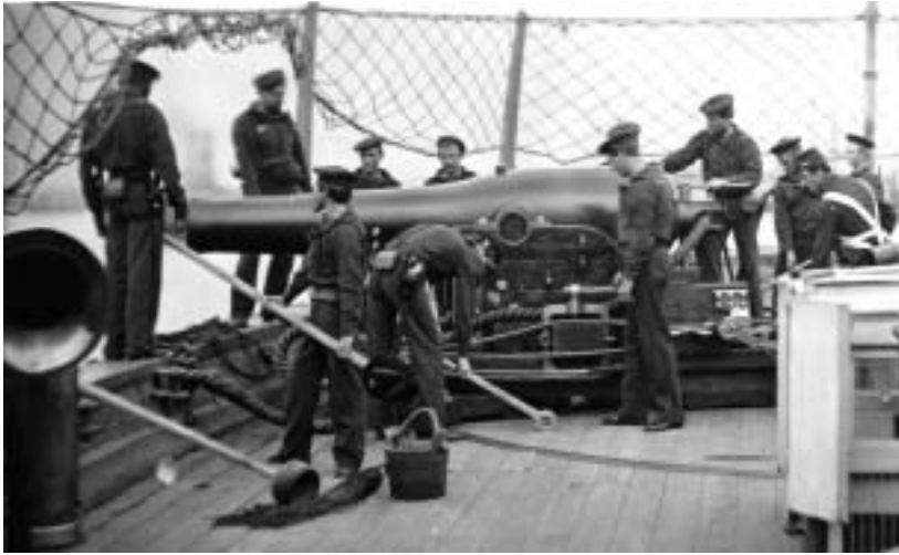
Crew working the gun on a Civil War Navy gunboat. (111-B-486)

ment data, and a summary of service. The series is arranged chronologically.