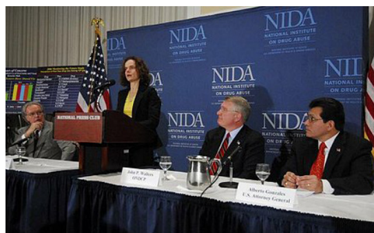
Top: NIDA director Dr. Nora Volkow unveils results of the Monitoring the Future survey.