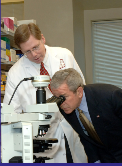
ABOVE • On his fifth visit to NIH, President Bush peers through microscope at NCI lab.