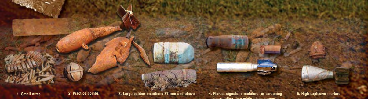
1. Small arms

The Army Range Inventory Program, 2000-2003, collected information on more than 10,500 operational ranges and all defense sites known to or suspected of containing unexploded ordnance, discarded military munitions and military constituents, 15.2 million acres in all. The Army began collecting updated operational range data from each installation on a two-to-five-year cycle in 2004. For properties no longer used by the military, the inventory data is used as the basis for the Military Munitions Response Program.