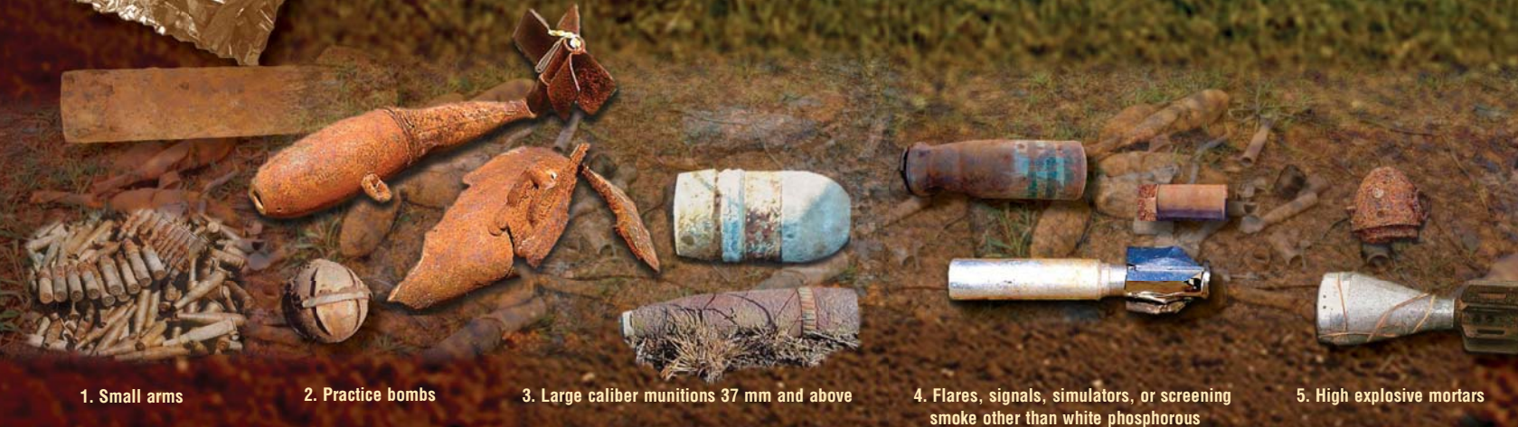
1. Small arms

The Army Range Inventory Program, 2000-2003, collected information on more than 10,500 operational ranges and all defense sites known to or suspected of containing unexploded ordnance, discarded military munitions and military constituents, 15.2 million acres in all. The Army began collecting updated operational range data from each installation on a two-to-five-year cycle in 2004. For properties no longer used by the military, the inventory data is used as the basis for the Military Munitions Response Program.