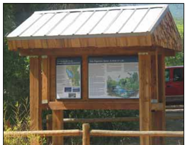
Information kiosk located near the parking lot of the Cottonwood Canyon (White Bridge) Access Site

Please respect our effort to restore the middle Provo River to a more natural condition. With your cooperation in using approved access points and keeping the corridor clean, the Provo River Restoration Project will increase the diversity of fish, wildlife habitat and riparian vegetation, leading to greater public enjoyment of the River and its resources for years to come.