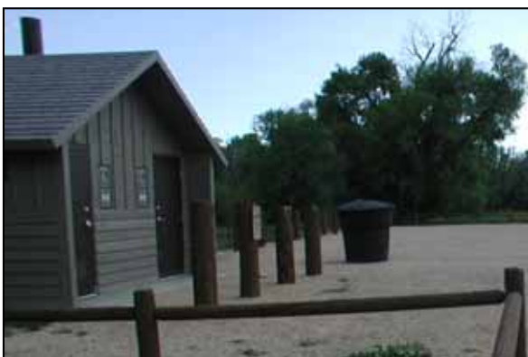
Restroom, fenced parking lot and trash receptacle at the River Road-South Access Site

Six of the angler access sites have been constructed (see map on back). Construction of the last site is anticipated to occur this year or next. As stipulated in the EIS, these are the only places where parking and access into and out of the river corridor is allowed. The sites are named according to their location: Jordanelle Access Site, Cottonwood Canyon Access Site, River Road-North Access Site, River Road-South Access Site, Midway Lane-North Access Site, Midway Lane-South Access site and Charleston Access Site.