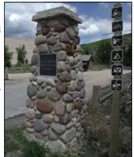
"Provo River Restoration Project" stone monuments stand at the access sites' entrance

minimizing impacts to wildlife and habitat being restored by the Project. Being a good neighbor to adjacent private landowners also has been a long-standing project priority and commitment, which requires limiting parking and access to the seven designated areas. As project construction nears completion, the Wasatch County Sheriff's office will be stepping up enforcement of the parking and access restrictions.