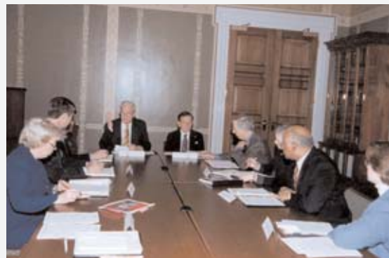
The Open World Board of Trustees convenes in March 2002 to elect its chairman and to plan the 2002 program

A Board of Trustees governs the Open World Leadership Center and its Open World Program. The Board held its inaugural meeting in March 2002 to approve plans and initial grants for the program year, and to elect its leadership.