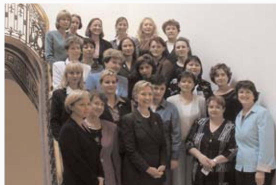
Women as leaders delegation hosted by Vital Voices meets with Senator Hillary Clinton (NY)

"Right away I obtained access to effective models for fighting trafficking and providing services," reported one participant. Said a fellow delegate, "I found out we are not alone. I'm from so far away, but there are so many of us."