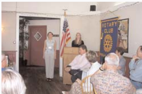
The National Peace Foundation hosts a delegation at a Rotary Club meeting in Asheville, North Carolina

The programmatic themes provided direction for the selection and composition of the delegations. Meetings and events for the visits reflected the theme of the delegation.