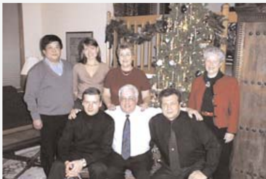
Russian delegation hosted by USDA International Institute enjoys holiday celebration in Portland, Oregon

Eighteen different nongovernmental and governmental organizations from across the United States, each with expertise in conducting international visitation programs, received grants from Open World to administer the Russian delegates' trips. These national hosting organizations in turn carried out the Open World visits with the help of a wide range of local organizations and institutions, including universities, civic groups, sister-city associations, and nonprofit education and training corporations.