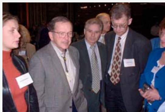
Senator Ted Stevens (second from left) confers with legislators from the Russian Far East in Anchorage, Alaska

headquarters; observed voting; celebrated Election Night with Senator Ted Stevens (AK) and Congressman Don Young (AK); and analyzed election results with Alaska state legislators. Russia's parliamentary and local elections planned for 2003 made Open World's election activities especially timely.