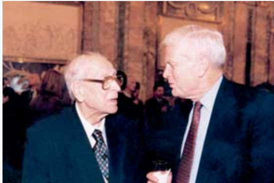
Academician Dmitri Sergeevich Likhachev and Dr. James H. Billington discuss the program in 1999