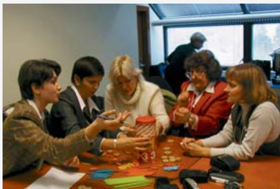
Women business leaders engage in team-building exercise in Washington, D.C.

Selection of Participants Candidates are nominated by prominent U.S., Russian, and international organizations and by Open World alumni. Applications go through multistage vetting by U.S. Embassy and Open World staff.