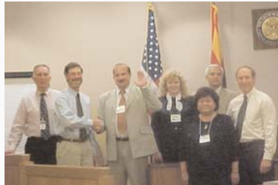
Judge Shishkin (waving) and delegation in Tucson, Arizona

conditions and relations with the guards. Other highlights of Judge Shishkin’s Tucson program included participating in a judges’ roundtable hosted by Judge Roll; observing a three-judge panel of the state Court of Appeals deliberate on two cases that had just been argued before them; attending a University of Arizona law school class; and watching a tribal court trial and then discussing the outcome with the presiding judge, the prosecutor, and the public defender.