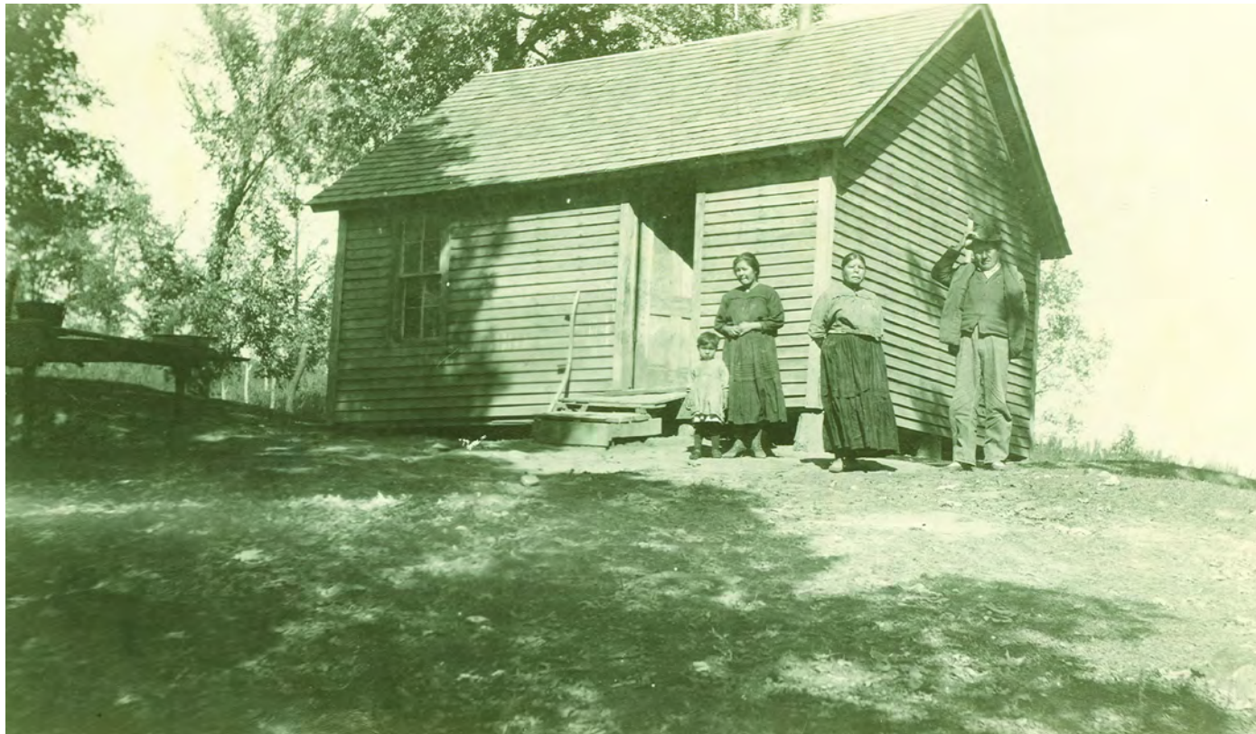
TAMA Indian Industry Survey, 1923

This image is part of the Tama survey. It depicts a family standing outside of their small home on the reservation. Photographs with residents standing in front of their dwellings are more prevalent in the Lac du Flambeau survey than the Tama survey. The presence or absence of individuals in photographs can be an indication of how the members of the communities felt about the local BIA administration.