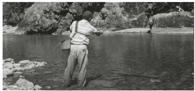
Man Fishing in River Mt. Hood NF #108