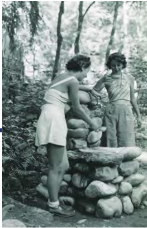
CCC Constructed Drinking Fountain at Verlot Camp Mt. Baker NF #54; Historical Photographs, 1914-1960

Records of Region 6, Pacific Northwest Region RG 95, NARA Pacific AK Region, Seattle, WA