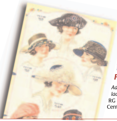
Exhibit: NARA's Central Plains Region Kansas City, Missouri Fashion Court

Advertisement for ladies' hats, c.1920. RG 21, NARA's Central Plains Region.