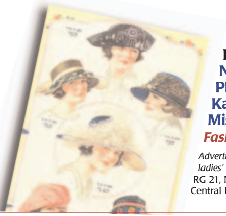
Exhibit: NARA's Central Plains Region Kansas City, Missouri Fashion Court

Advertisement for ladies' hats, c.1920. RG 21, NARA's Central Plains Region.