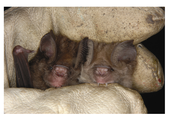
Figure 2. Two morphotypes of Hipposideros caffer ruber bats, held by one of the authors (F.G.R.) wearing a leather glove.