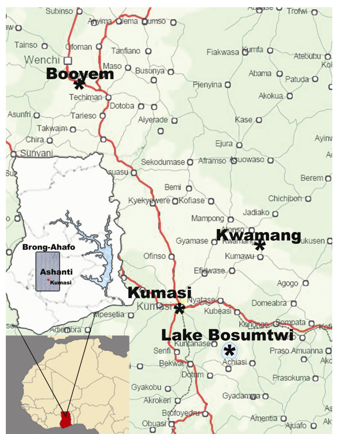
Figure 1. Location of Kwamang caves near the village of Kwamang (6°58'N, 1°16'W), 50 km northeast of Kumasi, Ashanti region, Ghana. Booyem caves A (7°43'24.9"N, 1°59'16.5"W) and B (7°43'25.7"N, 1°59'33.5"W) are located near remote small settlements in the vicinity of Booyem, Brong-Ahafo region. Lake Bosumtwi is located 30 km southeast of Kumasi (6°32'22.3"N, 1°24'41.5"W). The botanical gardens of Kwame Nkrumah National University of Science and Technology are located on campus in the city of Kumasi (6°41'6.4"N, 1°33'42.8"W). Kumasi Zoo is located in the center of the city (6°42'2.0"N, 1°37'29.9"W).