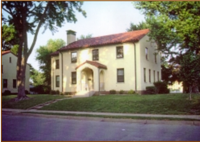
Single Family Officers Quarters, Fort Sill, OK

The Army established an innovative partnership program with other agencies and organizations to help manage its cultural resources. These partnerships enable agencies to share their programs and technical expertise directly with Army cultural resources managers.