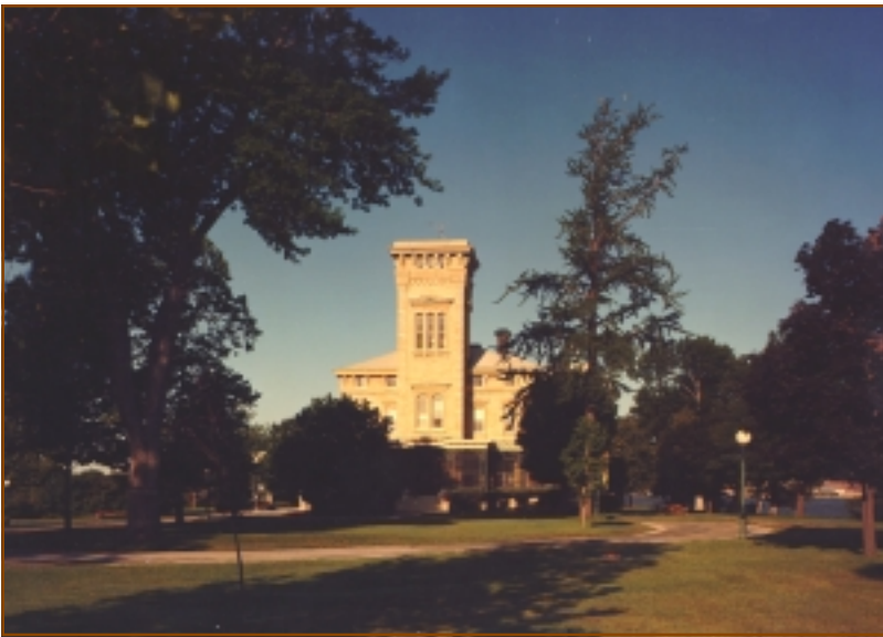
Quarters #1, Rock Island Arsenal, IL

owners. The Forest Service provides cultural resources management plans, planning level surveys, and cultural resources inventories. Several national forests provide mission-essential land to the Army through special-use permits. A recent interagency agreement between the Army and the Forest Service allows Forest Service staff to directly conduct required cultural resources programs on installations.