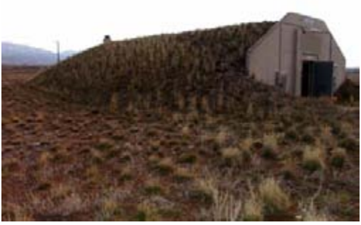
Ammunition Storage Facilities