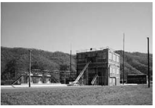
Ammunition Production Facilities

Actions covered by the Comments include ongoing operations, maintenance and repair; rehabilitation; renovation; mothballing; cessation of maintenance, new construction, demolition; deconstruction and salvage; remediation activities; and transfer, sale, lease, and closure of these categories of properties.