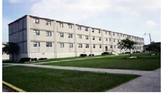
Unaccompanied Personnel Housing