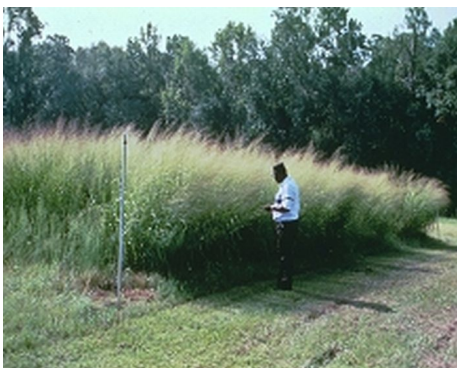
Figure 2. Lowland type switchgrass in full flower at the USDA, NRCS, Brooksville Plant Materials Center in Brooksville, FL

general appearance of the plant is that of a loose bunchgrass, but it has short rhizomes and stands can thicken to form a sod. Two general morphological types are recognized. The lowland type has tall, coarse stems and is adapted to poorly drained soils, while the upland type has short, fine stems and is more drought tolerant.