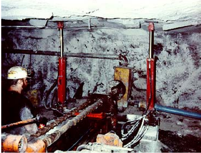
In-mine directional drilling.