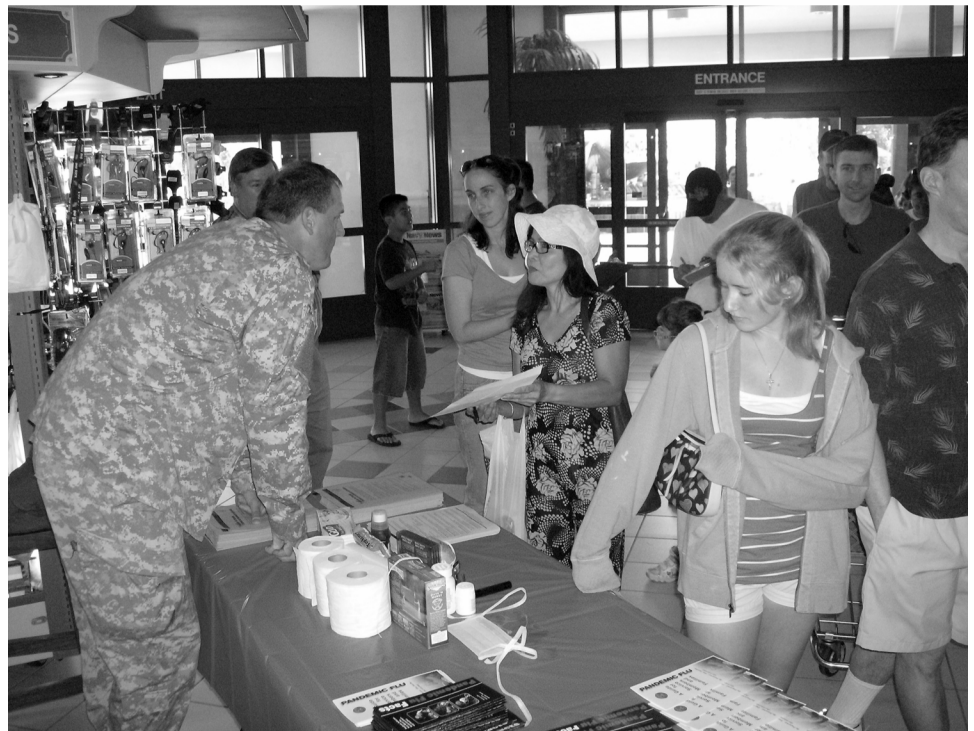
Figure 4: Official Provides Information about Pandemic Influenza at PACOM's Outreach Event

each directorate or office met to discuss the impact that a 40 percent absenteeism rate due to personnel being sick, caring for someone who was sick, or afraid to come to work, would have on the individual directorate or office. 16 Additionally, in March 2006, EUCOM directed service subcomponents that had not already done so to hold installation-level meetings to inform military and civilian personnel, contractors, dependents, and beneficiaries about the threat of avian influenza and related preventive measures.