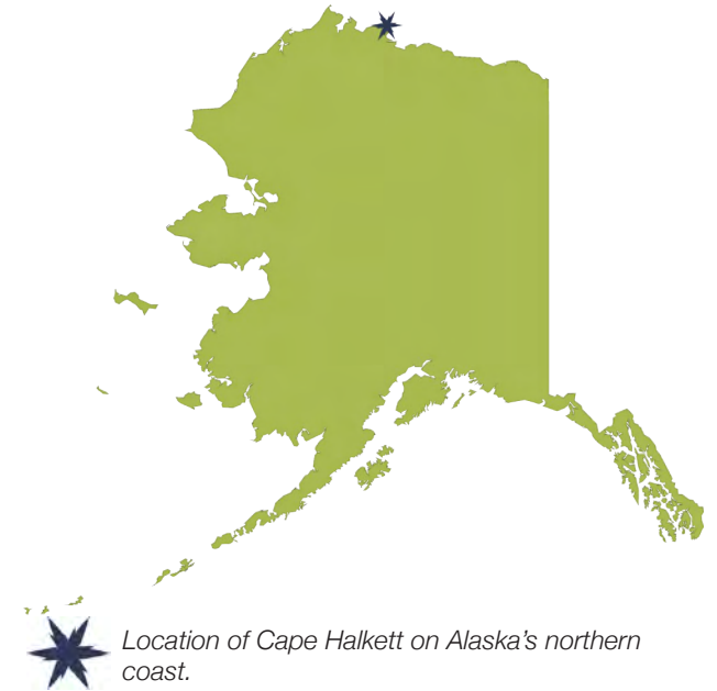
Location of Cape Halkett on Alaska’s northern coast.

http://landsat.gsfc.nasa.gov http://landsat.usgs.gov