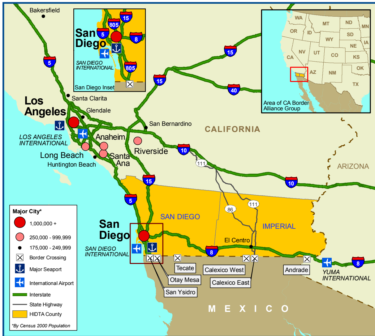
Figure 1. California Border Alliance Group region.

This assessment provides a strategic overview of the illicit drug situation in the California Border Alliance Group (CBAG) region of responsibility, highlighting significant trends and law enforcement concerns related to the trafficking and abuse of illicit drugs. The report was prepared through detailed analysis of recent law enforcement reporting, information obtained through interviews with law enforcement and public health officials, and available statistical data. The report is designed to provide policymakers, resource planners, and law enforcement officials with a focused discussion of key drug issues and developments facing the CBAG region.