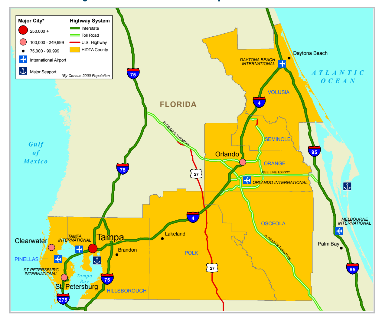
Figure 3. Central Florida HIDTA Transportation Infrastructure

Various DTOs, criminal groups, and local independent dealers distribute illicit drugs at the midlevel and retail level in the region (see Table 4 on page 13); their methods of operation change little from year to year. Retail-level distribution typically takes place at open-air drug markets, in local clubs, in apartment buildings, in local motels, in vehicles, at college residence halls, on local beaches, and at prearranged meeting sites such as parking lots. The Orange Blossom Trail (also known as OBT) is a notorious retail drug distribution area in Orlando. Ice methamphetamine is typically not distributed in open-air markets, because of the erratic behavior often displayed