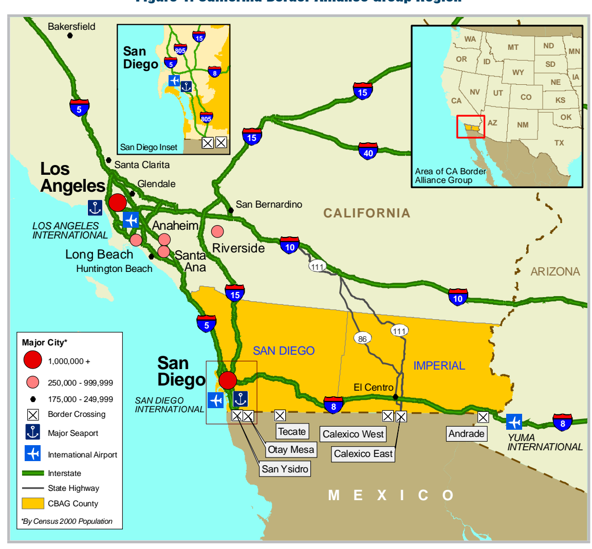
Figure 1. California Border Alliance Group Region

This assessment provides a strategic overview of the illicit drug situation in the California Border Alliance Group (CBAG) region of responsibility, highlighting significant trends and law enforcement concerns related to the trafficking and abuse of illicit drugs. The report was prepared through detailed analysis of recent law enforcement reporting, information obtained through interviews with law enforcement and public health officials, and available statistical data. The report is designed to provide policymakers, resource planners, and law enforcement officials with a focused discussion of key drug issues and developments facing the CBAG region.