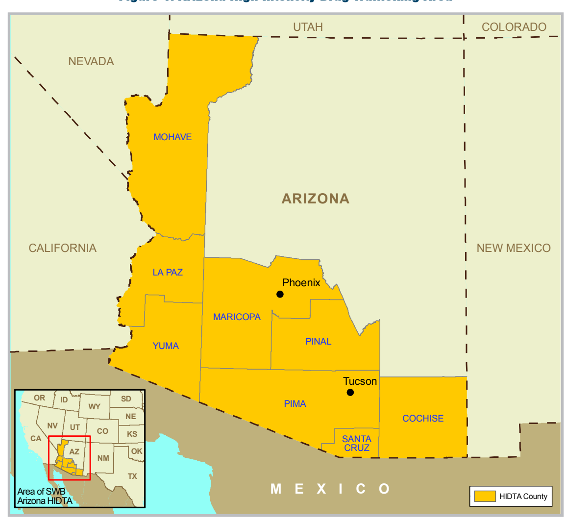
Figure 1. Arizona High Intensity Drug Trafficking Area

This assessment provides a strategic overview of the illicit drug situation in the Arizona High Intensity Drug Trafficking Area (HIDTA), highlighting significant trends and law enforcement concerns related to the trafficking and abuse of illicit drugs. The report was prepared through detailed analysis of recent law enforcement reporting, information obtained through interviews with law enforcement and public health officials, and available statistical data. The report is designed to provide policymakers, resource planners, and law enforcement officials with a focused discussion of key drug issues and developments facing the Arizona HIDTA.