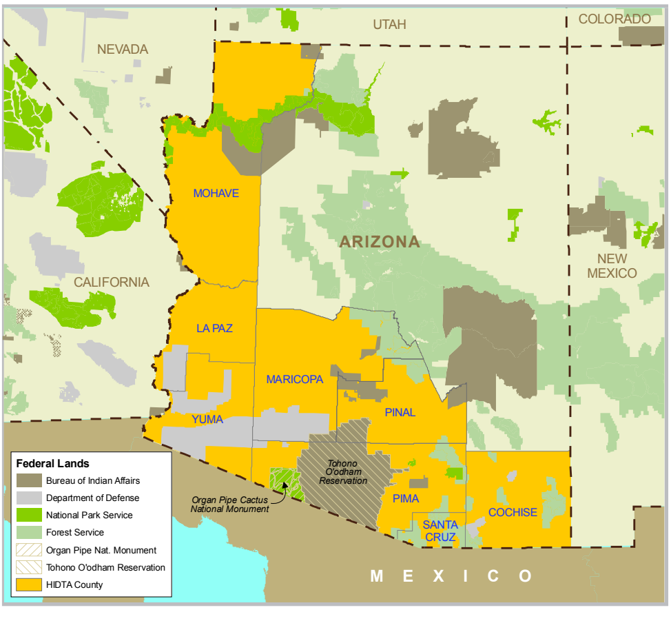
Figure 4. Federal and Tribal Lands in Arizona

over 2,000 pounds of marijuana from a cloned United Parcel Service (UPS) delivery truck. The vehicle was disguised to resemble a UPS truck, including the use of reflective UPS decals, an authentic vehicle number, and paint. In recent years Arizona law enforcement officers have seized illicit drugs from cloned Federal Express, U.S. Postal Service. Forest Service. and USBP vehicles. In addition, Mexican DTOs appear to be testing the viability of ultralight<sup>8</sup> and Cessna aircraft as alternative modes for transporting wholesale quantities of illicit drugs into Arizona. CBP reported three incidents involving ultralight aircraft transporting small amounts (between 100 and 350 pounds) of marijuana across the U.S.-Mexico border between October and December