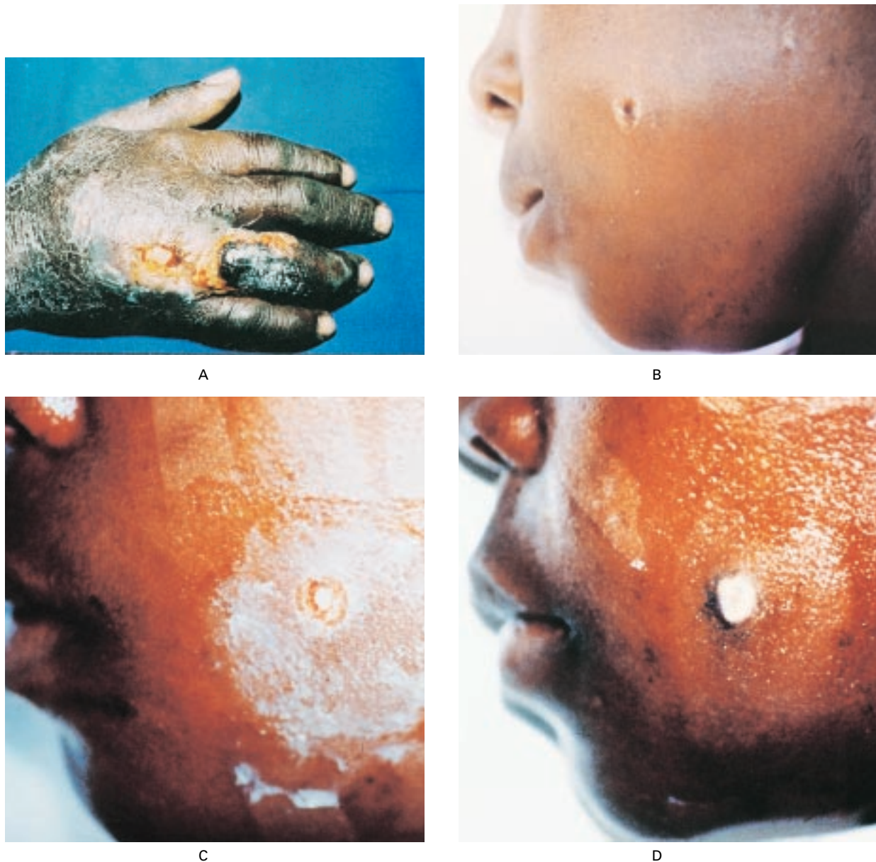
Figure 2. Cutaneous Anthrax Infection of the Hand and Cheek.

Panel A shows the characteristic blackened eschar surrounded by eroded areas and massive edema. These lesions are painless. The areas of "dried skin" represent resolving edema. Lesions continue to progress despite rigorous antibiotic treatment. Cutaneous anthrax can be self-limiting, and the lesions resolve without scarring. About 10 percent of untreated cutaneous anthrax infections progress to systemic anthrax. Panels B, C, and D show changes in the lesion on the cheek over a seven-day period. The characteristic blackened eschar is present on day 0 (Panel B). Facial edema and ulceration occur by the second day (Panel C). On day 7, the lesion is beginning to heal, and the facial edema is resolving (Panel D).