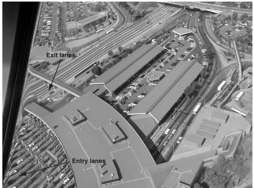
Figure 3: Aerial View of San Ysidro, California, POE