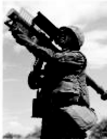
U.S. Stinger missile system