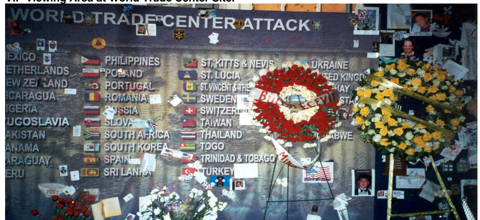
VIP Viewing Area at World Trade Center Site.

Overall, charitable aid made a major contribution in the nation's response to the September 11 attacks, despite very difficult circumstances. Through the work of charities, millions of people contributed to the recovery effort. At the same time, lessons have been learned that could improve future charitable responses in disasters, including easing access to aid, enhancing coordination among charities and between charities and the Federal Emergency Management Agency (FEMA), increasing attention to public education, and planning for future events. FEMA and some charitable organizations have taken some steps to address these issues. However, the independence of charitable organizations, while one of their key strengths, will make the implementation of these lessons dependent on close collaboration and agreement among charities involved in aiding in disasters.