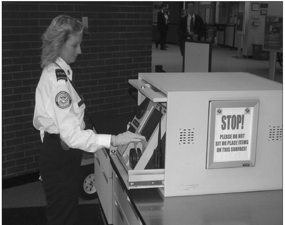
Figure 2: ETD Machine Used by TSA to Screen Checked Baggage