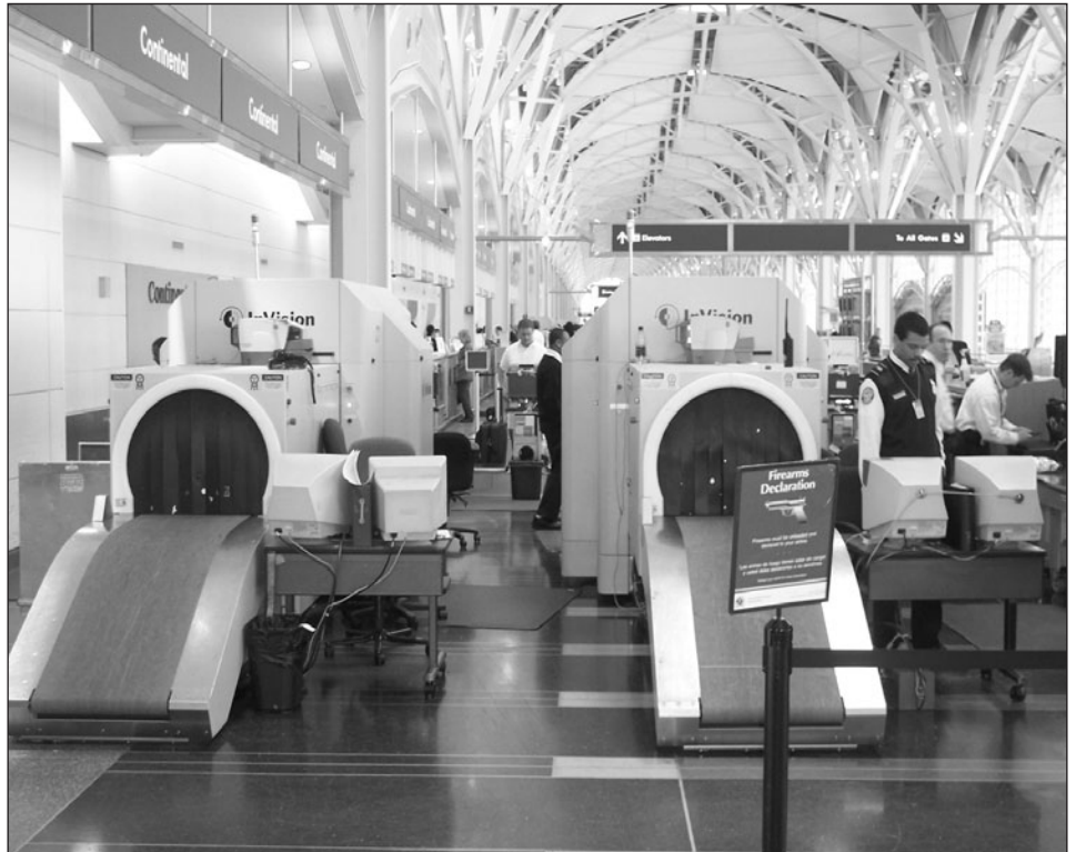
Figure 1: EDS Machines In a Stand-alone Configuration Used by TSA to Screen Checked Baggage