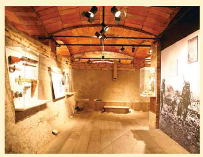
South Carolina Confederate Relic Room and Military Museum's Forgotten Stories: South Carolina Fights the Great War exhibition.

The state museum conducted informal surveys of 400