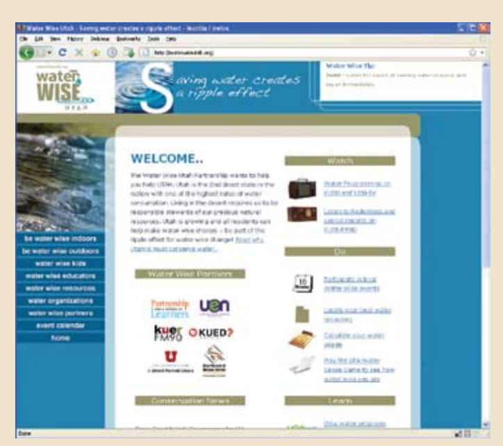
The Water Wise Utah Web site continues to provide the community access to valuable resources on water conservation.

"We handed out easily 5,000 water wheels and 5,000 cups," said Lisa Cohne, Water Wise Utah's project director.