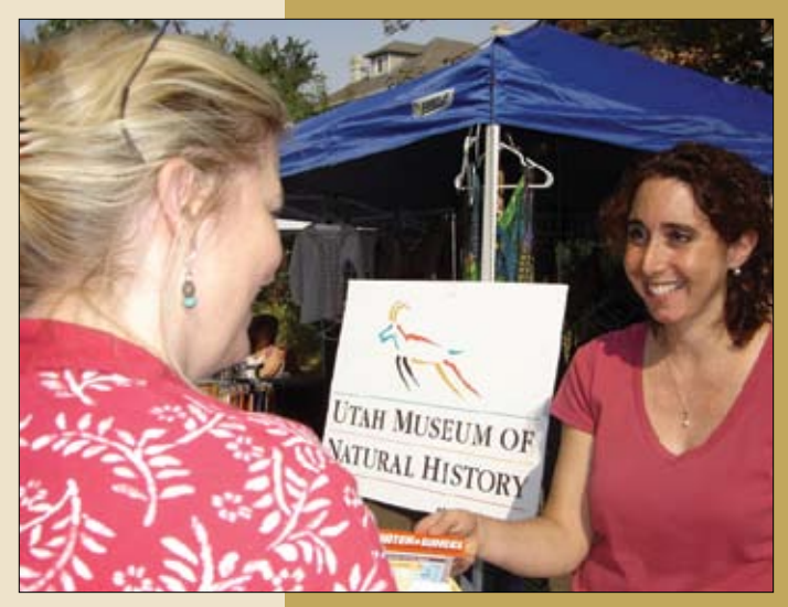
Left: Bus tail advertisements spread the water conversation message throughout the Wasatch Front. Right: Community events proved a valuable opportunity to raise awareness and answer questions.