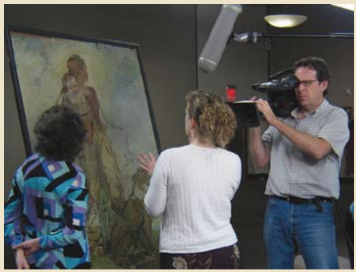
Individuals received one-on-one consultations with conservators at the "Heirloom Health Clinics."