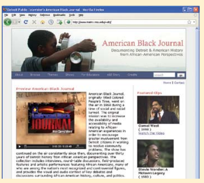
The online archive of videos from the American Black Journal TV series is available at www.matrix.msu.edu/~abj.

One lesson learned was that when it comes to creating a resource for schools to use, it pays to have teachers involved from the start. From Resistance to Rights convened its Teachers Advisory Board—consisting of five social studies and history teachers from the mid-Michigan and Detroit areas, who teach grade four to college—at the beginning of the Web site development process. The teachers have provided invaluable insights about presenting educational materials, adhering to school district guidelines, and meeting state standards.