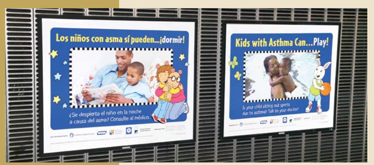
Ads and posters were displayed inside 400 MBTA subway and bus cars, on 30 bus shelters, and on the sides of nearly 200 buses in the target neighborhoods.