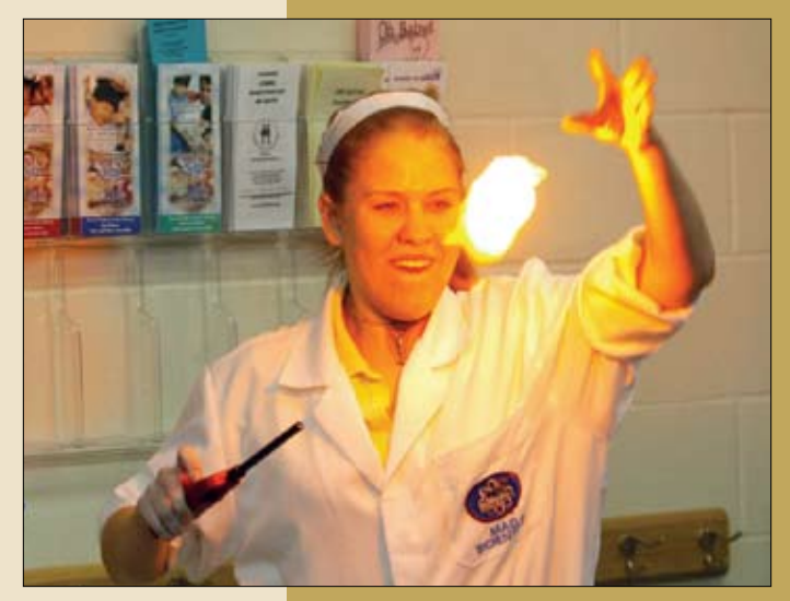
Left: Children explore natural history fossils at Wonderscope's Science Camp. Right: The library incorporated science presentations throughout their summer reading programming in 2007