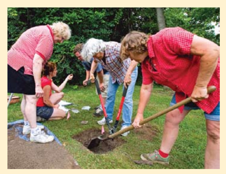
Teachers and volunteers were trained in digging techniques by professional archeologists.

Some strong partnerships evolved from the project. For example, several Voyages teachers are now on the Chimney Point advisory committee to create Vermont's virtual archaeology museum.