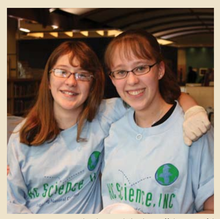
Youth volunteers helped to staff the successful Family Science Nights at the library.

The library hosted hands-on Mad Science programs, held in conjunction with the summer reading program, and integrated science into children's activities such as story time.